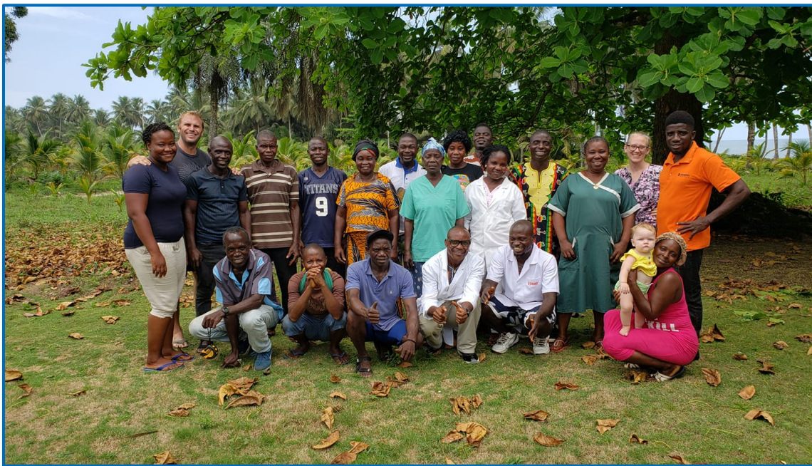
Po River Medical Clinic Team

We are enthusiastic about talking to you more about this incredible opportunity to see if you might be a good fit for this important role